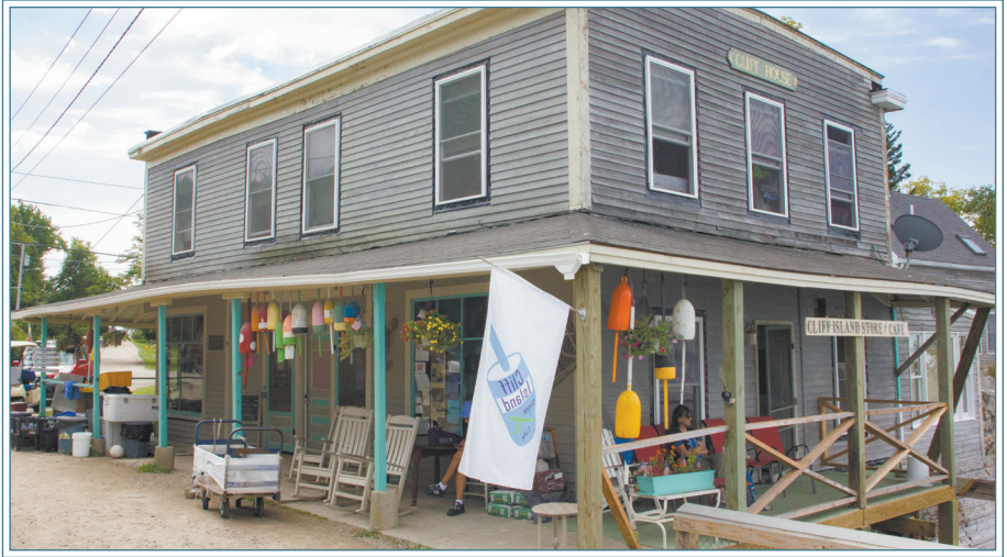
Cliff Island General Store