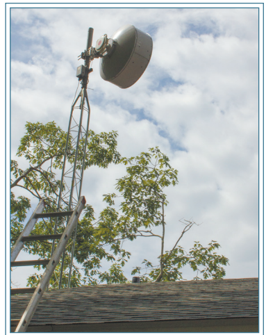
Microwave transmission tower, receiving internet transmission from Portland to Cliff Island

In addition to the planned renovations at 16 Fishermen's Cove, in early 2020 the group purchased a large, former year-round home to turn into two modern apartments. One of these dwellings will be reserved for the island's teacher, which is particularly helpful as housing has been a concern for previous teacher applicants.