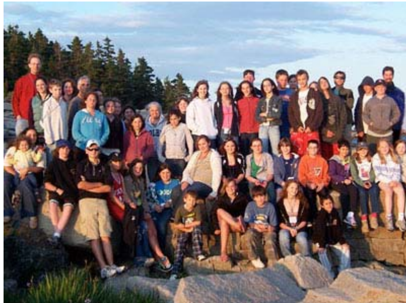
Middle School Week

Approximately 130 students and teachers descended upon the Schoodic Education and Research Center (SERC) in Winter Harbor in July for the Summer Institutes. Students learned about facilitative leadership, teachers worked on how to integrate technology into their curriculum, and, of course, all participants spent many hours developing their skills in their technology of choice.