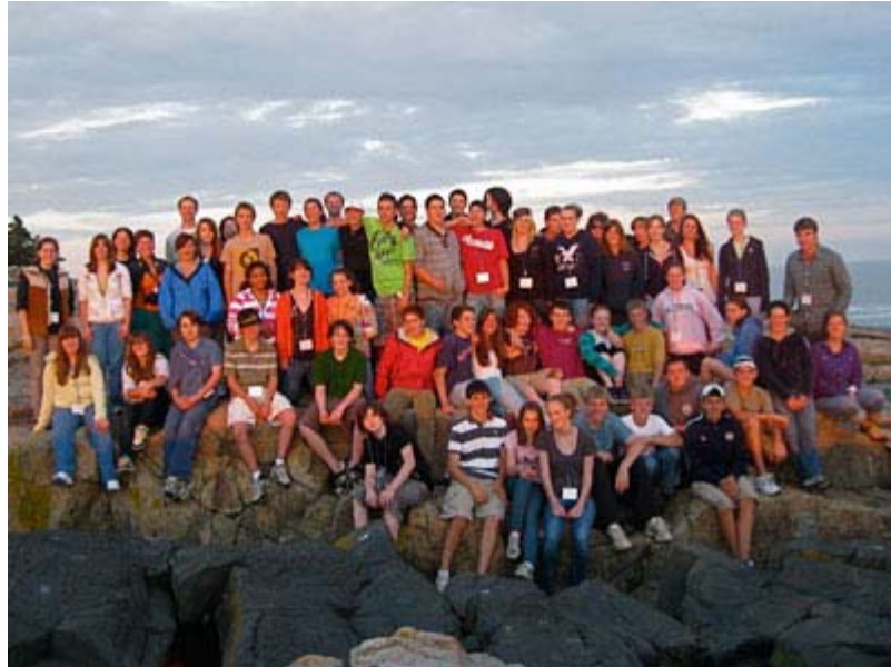
High School Week

In the GIS classes, participants learned about Google Earth and QGIS (an open-source Mac-compatible GIS software), and worked on more advanced projects, such as 3D modeling using the ArcView software.